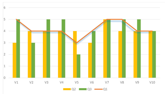
Fig. 2 Covid-19 perception on the motivation of employees

Determining Covid-19 perception of employees on their motivation was assessed by answering the three statements Q1: "I believe Covid-19 has hurt the motivation of employees"; Q2: "The corona pandemic is making me feel discomfort"; and Q3: "Downsizing in time of Covid-19 had a negative effect on my work motivation". The last question was deemed crucial because the company in question had to downsize in the previous year owing to Covid-19. Fig. 2 shows that downsizing harmed all 10 volunteers in our study.