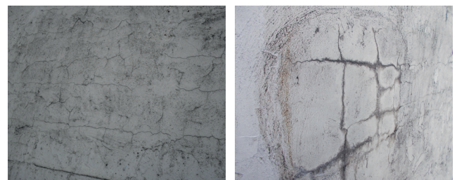
Fig. 1 Cracked surface of repair material

Moreover, the results of an analysis of the distribution and magnitude of the shear stresses occurring at the native material/repair material interface after the renovation or reinforcement of the cooling tower are reported. This analysis complements the analysis of the stress state of the cooling tower shell under all the relevant loads and it should always be carried out as part of cooling tower load-bearing capacity check calculations performed after an extensive cooling tower renovation.