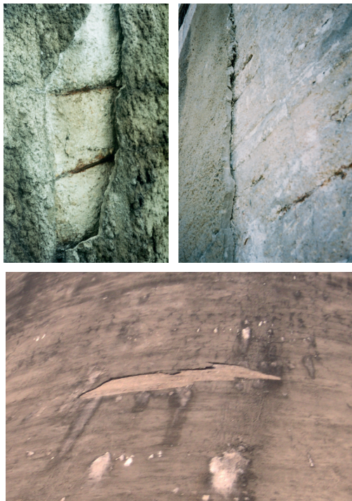
Fig. 2 Examples of repair material (shotcrete) debonding from native material of cooling tower

The distribution and values of shear stress in the cooling tower shell change from the design ones when the cooling tower renovation consists in replacing the degraded concrete with other concrete whose E-modulus value differs from that of the cooling tower's native material. Shear stress in the cooling tower shell also increases when the native concrete is strengthened with reinforced ribs or a new continuous reinforced coat or when the cooling tower shell is sprayed with unreinforced shotcrete. In each of the cases the shotcrete layer adds to the cooling tower shell thickness. Shotcrete debonding cases were reported in, i.a., Martin [1].