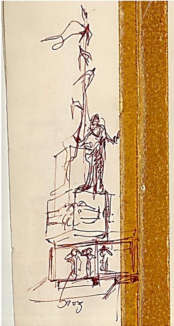
Fig. 4 The disputed concept design sketch (Source: author)

The realised design has three specific elements – the hillock, the figures, and the flag – and their respective statements and objectives are included in Table 1. The pathway to the top of the hillock and the vista of the bronze letters